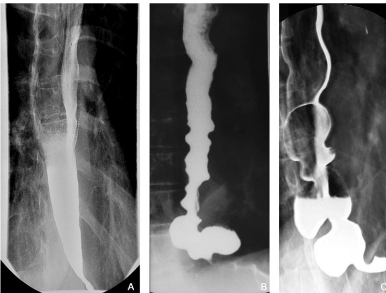
Figure 1. Barium esophagrams on achalasia patients demonstrating a dilated esophagus and tapering of the distal esophagus with the classic “bird’s beak” (A), diffuse narrowing of the esophagus with a spastic appearance often seen in “vigorous” achalasia and a large epiphrenic diverticulum (B), and a dilated and tortuous esophagus with early “sigmoidization” of the esophagus (because of its visual similarity to the sigmoid colon on barium enema) observed in long standing achalasia accompanied by multiple pulsion diverticuli (C).

Endoscopic evaluation of the esophagus and stomach is recommended in every patient with achalasia to ensure that there is not a malignancy causing the disease or esophageal squamous cell carcinoma complicating achalasia. At endoscopy, a dilated esophagus with a tight LES that “pops” open with gentle pressure is often observed, as is retained food and saliva. However, a normal esopha-