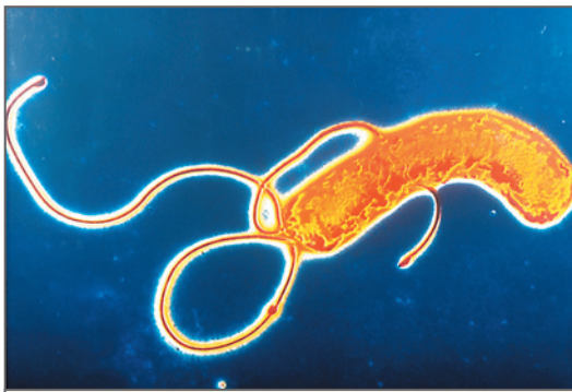
Figure 1. Helicobacter pylori .

H. pylori is a gram-negative bacterium with a helical rod shape. It has prominent flagellae, facilitating its penetration of the thick mucous layer in the stomach.